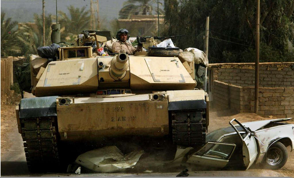
Speeding tanks causing smashed cars on Camp Victory led to the reinstatement of speed bumps near the Sports Oasis Mess Hall

condition of the main road on Camp Speedbump remains hideously atrocious and an embarrassment to coalition forces charged with care and maintenance of facilities. The stretch of road between the PX and the Al-Faw Palace is referred to as the absolute worst road in Iraq. It is even being used by the University of Georgia as a study aid for Civil Engineering students as a "worst case scenario" model for road repair. Many coalition force troops have been squashed because drivers could not see them inside the waist-deep potholes as they crossed the street. Haifa Street in Baghdad with all the IED craters is a much smoother road than the main artery of Camp SpeedBump.