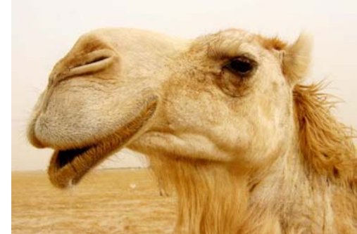
Its just a picture of a camel, people. OK so the camel may have just been laid, whereas you have nothing to smile about.

No proofreading, this Rag is probably full of fucking spelling errors and bad contxt. Who cares though? I mean the Rag exists for content, not format. Well, that's it. That's all. You can ask for #21 all day long but if it isn't ready, then by god I isn't fucking ready! Are you people THAT starved for a chuckle? Can you not send in your GAY stories for us to publish? I know there are plenty of gay-ass stories out there.